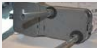
INSERT ADAPTOR, INTERCONNECT TUBES & TURN TOWARD AIRFLOW