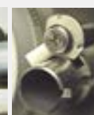
LOCK TUBES USING RETENTION CLIP