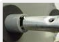
INSERT TUBES & TURN TOWARD AIRFLOW