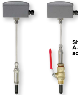
Shown with A-IEF-VLV-BR** accessory valve kit