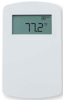
North American style